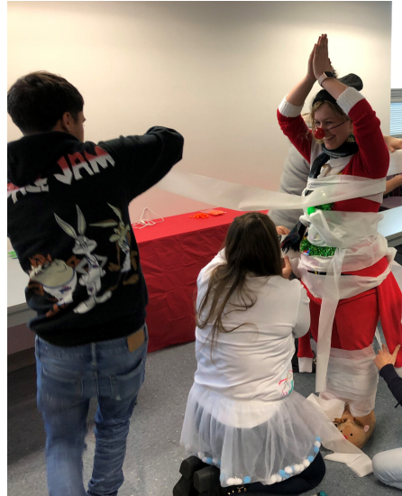
Holiday party fun

Phone: 717-295-2499 Website: http://lca.k12.pa.us/ Facebook: https://www.facebook.com/Lancaster-County-Academy-128800176479/